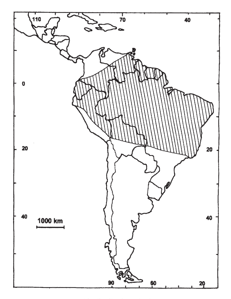
Fig. 3.—Geographic distribution of Choeroniscus minor.