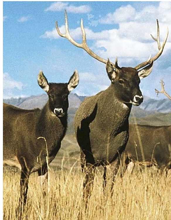
Fig. 1. —Mature female (left) and male Przewalskium albirostre in northeastern Tibet, China; note diagnostic features including white muzzles, inner ears, and chins; heads darker than bodies; pointed ears; and distance between the 1st and 2nd tines on the male’s antlers and uniform plane of the tines.

Cervus thoroldi Blanford, 1893:444, pl. 34. Type locality “about 200 miles N.E. of Lhasa [= Lhasa],” Tibet, China.