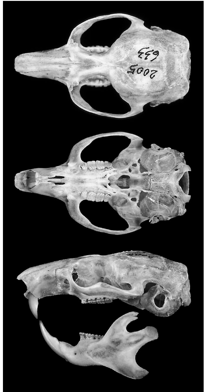
Fig. 2. —Dorsal, ventral, and lateral views of skull and lateral view of mandible of Glis glis (adult female from Donje Bare, Mt. Zelengora, Bosnia and Herzegovina; Slovenian Museum of Natural History 2005/633). Greatest length of skull is 43.0 mm. Photographs by C. Mlinar used with permission.

The range mainly coincides with the deciduous forest zone in the western Palearctic (Fig. 3). Glis glis is widespread in western, central, and southeastern Europe except Denmark, the Atlantic coasts of the Low Countries, and France; it is also absent from the majority of the Iberian Peninsula (Storch 1978). The range is mosaic in deforested regions of central Europe and in the forest-steppe zone in Moldova, Ukraine, and Russia. Range in Russia is in 2 main parts, the western and the eastern, with additional scattered isolates (Likhachev 1972). The northern border follows the line of Gauja National Park (Latvia—Valdis 2003)—Pskovk—River