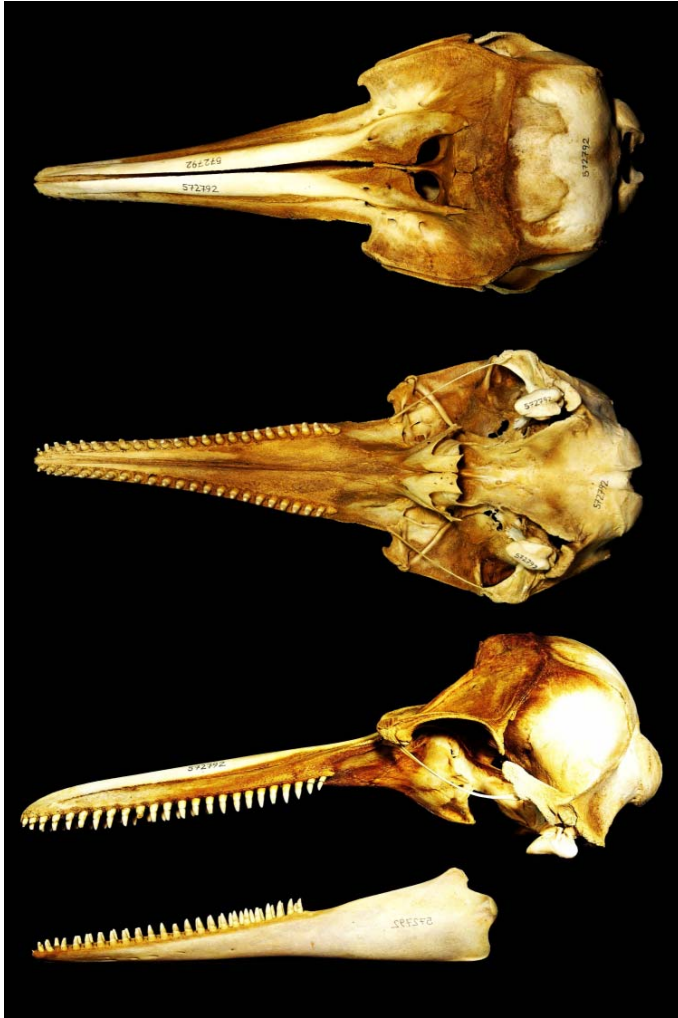
Fig. 2. —Dorsal, ventral, and lateral views of the skull and lateral view of mandible of an adult female Steno bredanensis (National Museum of Natural History 572792). Note that view of the right mandible has been reversed to align it with the cranium. Specimen is from Wreck Island, Virginia. Condylobasal length of skull is 503 mm.

NOMENCLATURAL NOTES. The historical nomenclature of S. bredanensis is particularly confusing. Schevill (1987) and Flower (1884) have both provided accounts of this history. The fate of the type specimen is unclear and it may have been lost. The relationship between S. perspicillatus and S. bredanensis is addressed by Fraser (1966).