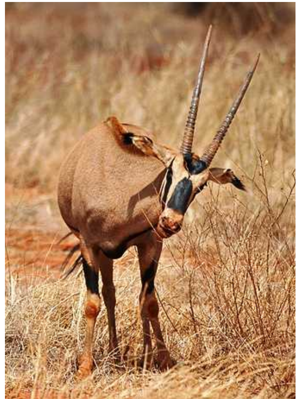
Fig. 1. —Mature male Oryx callotis south of Mount Kenya in central Kenya; note the diagnostic tufts of hair extending from the ends of the ears, pronounced horn rings, and the selective browsing.

CONTEXT AND CONTENT. Order Artiodactyla, suborder Ruminantia, infraorder Pecora, family Bovidae, subfamily Antilopinae, tribe Hippotragini. We followed the new ungulate taxonomy of Groves and Grubb (2011), who thoroughly and quantitatively updated the family Bovidae,