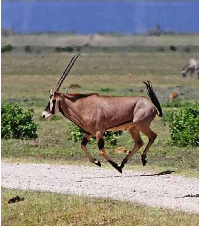
Fig. 4. — Oryx callotis galloping across an open grassland habitat in southern Kenya; such a gait is typical during circular tournament displays in which linear hierarchies are learned, tested, and reinforced (Kingdon 1997).