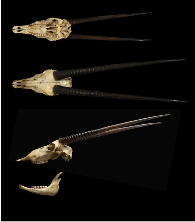
Fig. 3. —Ventral, dorsal, and lateral views of skull and lateral view of mandible of Oryx callotis (United States National Museum of Natural History, specimen 18944, sex unknown), collected by W. L. Abbott (date unknown) near Taveta in southern Kenya and the northern border of Tanzania. Greatest length of skull is 374.4 mm, average basal circumference of horns is 15.2 cm, left horn length is 70 cm, and tip-to-tip distance is 22.8 cm. The basal circumference of horns may suggest a male specimen, but the high degree of similarity of horn and skull measurements of female and male O. callotis makes it impossible to know the sex of this specimen (C. P. Groves, pers. comm.).

Galana Ranch in southeastern Kenya, daily fecal output in grams per day and percent fecal nitrogen concentrations of O. callotis were 1,378 \pm 91.2 SE and 1.22 \pm 0.051 in the dry season (April–August) and 969 \pm 67.5 and 1.57 \pm 0.022 in the wet season (January–May—Stanley Price 1985). The relatively low levels of fecal nitrogen suggested diets of only 7.6–10.2% crude protein (Leslie et al. 2008) and reflected the low-quality grasses that O. callotis generally consumed, regardless of season (Stanley Price 1985).