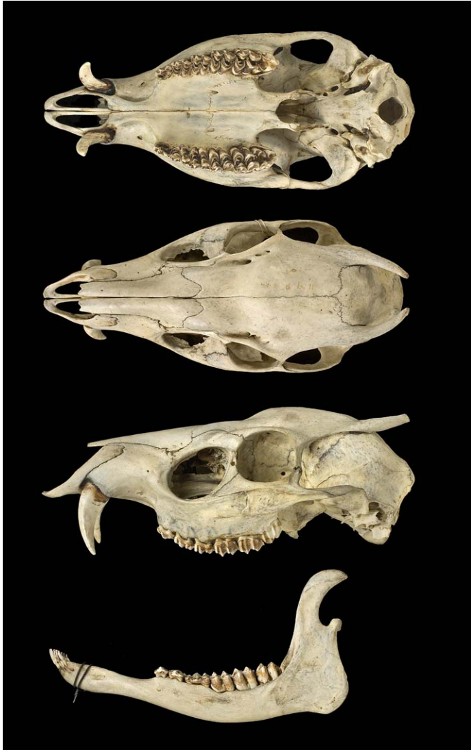
Fig. 3. —Ventral, dorsal, and lateral views of skull and lateral view of mandible of an adult male Elaphodus cephalophus (The Natural History Museum, London, specimen 11.9.8.44); upper canines, particularly large preorbital openings, and reduced and convergent antler pedicels (on males only) are characteristic. Greatest length of skull is 196.0 mm.