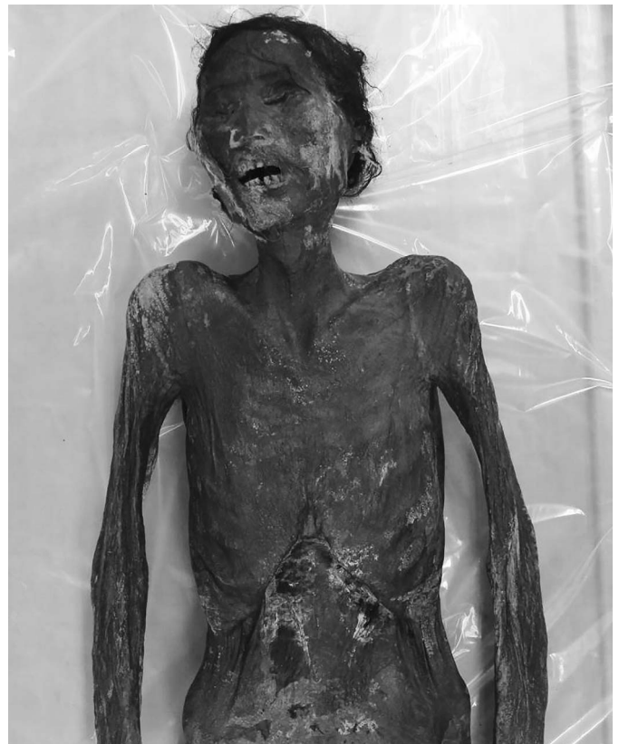
FIGURE 1. Cheongdo mummy.

On October 2014, a 17th century Joseon tomb was found in Cheongdo, a southeastern county in South Korea. In this tomb, together with well-preserved clothes, a mummy was discovered (Fig. 1). The specimen's preservation status was excellent. The