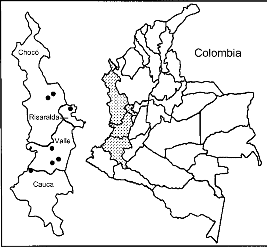
Fig. 1. Known global distribution of Mahanarva bipars .

tory Museum (UK, 3 specimens), Universidad del Valle (Colombia, 2 specimens) and the Universidad Nacional sede Palmira (Colombia, 6 specimens). Together with our field collections, all known reports of M. bipars are listed below and mapped (Fig. 1). This species has only been collected from the Colombian departments of Cauca, Chocó, Risaralda and Valle del Cauca, representing the Pacific coast east to the central cordillera of the Andes.