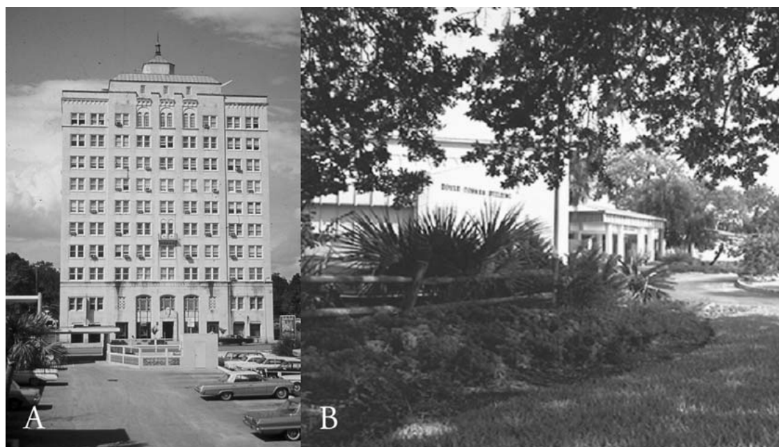
Fig. 2. The Seagle Building (A) and Doyle Conner Building (B) in Gainesville, Florida successively housed the State Plant Board.

In addition to intentionally introducing insects for whatever purpose, some pests have arrived accidentally on agricultural products. The gypsy moth, Lymantria dispar (L.), was imported into the Northeast from Europe in about 1869 to improve silk production. Egg masses are routinely found in Florida on campers and travel trailers that arrive in the fall from infested areas. However, due to Florida's warm climate, this pest does not become established. The European corn borer, Ostrinia nubilalis (Hubner), was accidentally introduced in about 1908 on broomcorn from Italy or Hungary. By 1938, it had spread over practically all of New England. It reached the Florida Panhandle in 1975 when it was found in seven counties by DPI inspectors. The Japanese beetle, Popillia japonica Newman, was introduced into