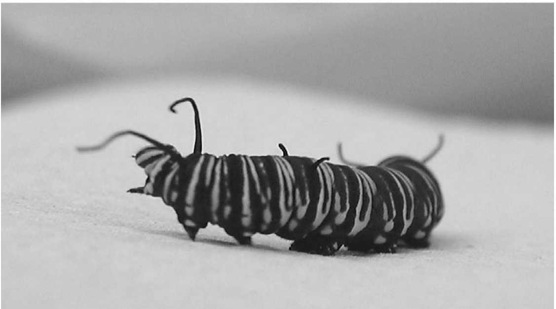
Fig. 1. Two of 11 monarch butterfly larvae with three tubercle pairs found in South Florida. Photos taken by A. K. Davis on Jan. 12, 2004.