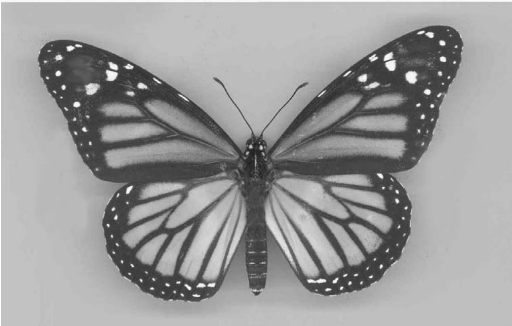
Fig 2. A. The “J” stage and chrysalis of the larvae with three tubercle pairs (note the small third tubercle remnant). B. Adult morphology of one of the 11 aberrant individuals, which was visually indistinguishable from the ‘normal’ type of individual reared from the same site.