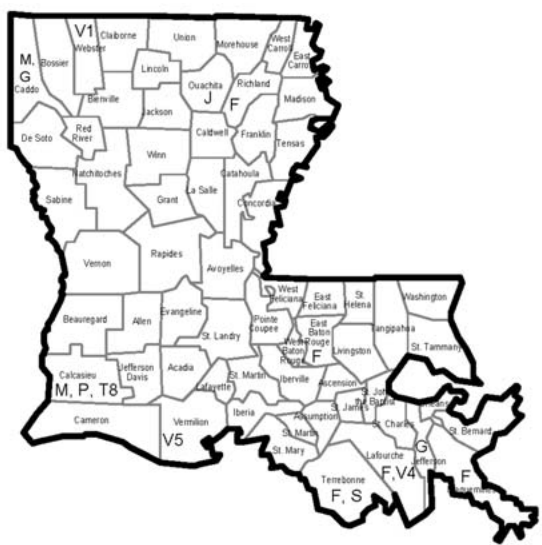
Fig. 2. Species distribution of Reticulitermes haplotypes in Louisiana. Letters indicating haplotypes are given in Table 1.

A haplotype or allele is defined by one unique form of the gene and differs from any other haplo-