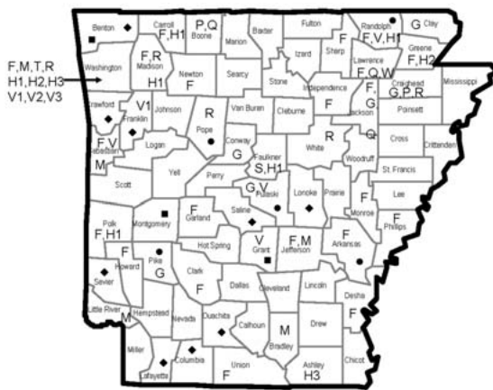
Fig. 1. Species distribution of Reticulitermes haplotypes in Arkansas. Samples obtained from the National Termite Survey, but not subjected to genetic analysis are marked as “◆” R. flavipes , “●” R. virginicus , “■” R. hageni . Letters indicating haplotypes are given in Table 1.

apparent consistency of haplotype occurrence for Reticulitermes spp. in this study based on geography. However, we found genetic divergence values similar to those detected in our previous works (Austin et al. 2004a, b).