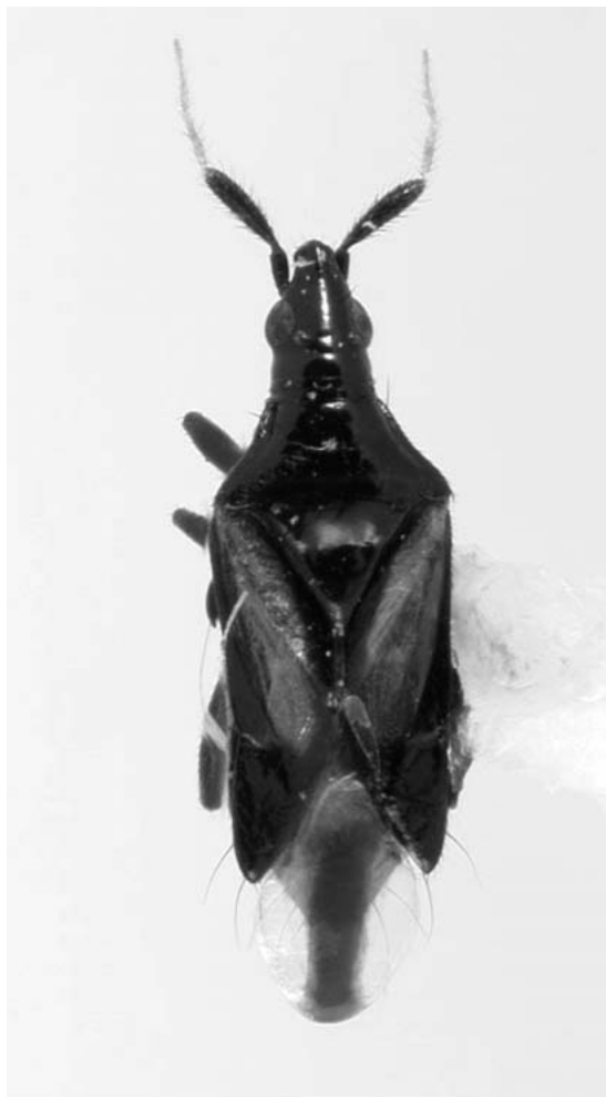
Fig. 1. Montandoniola moraguesi , dorsal view.