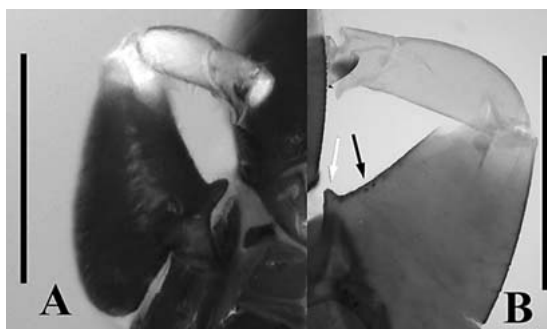
Fig. 2. Fore femur of Androthrips ramachandrai from Riverside Co., CA. (A) Wet mounted, right ventral fore femur and (B) slide mounted, cleared left fore femur. The white arrow is pointing to the strong, cylindrical tooth near the base and black arrow to the row of small tubercles. Scale bars = 250 \mu m.

The 2 records from California are new state records, because the previous record was an intercepted specimen from Thailand (see above). The records from Texas and Hawaii also are new state records.