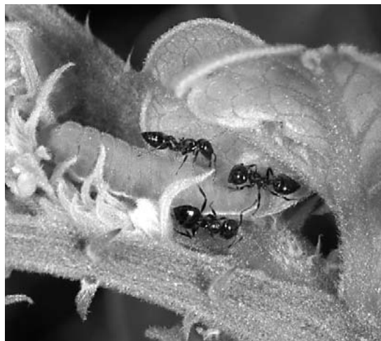
Fig. 1. Crematogaster ashmeadi ants tending a late instar Cyclargus thomasi bethunebakeri larva. Several other C. ashmeadi ants were present but not visible in this photo.

Both Forelius pruinosus and Tapinoma melanocephalum may be opportunistically imbibing food rewards from C. t. bethunebakeri larvae. Field observations suggest that their behavior offers little or no protection for the larvae they tend;