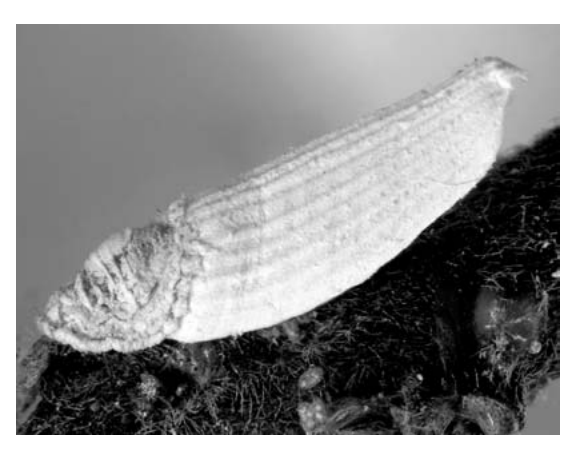
Fig. 1. Crypticerya genistae