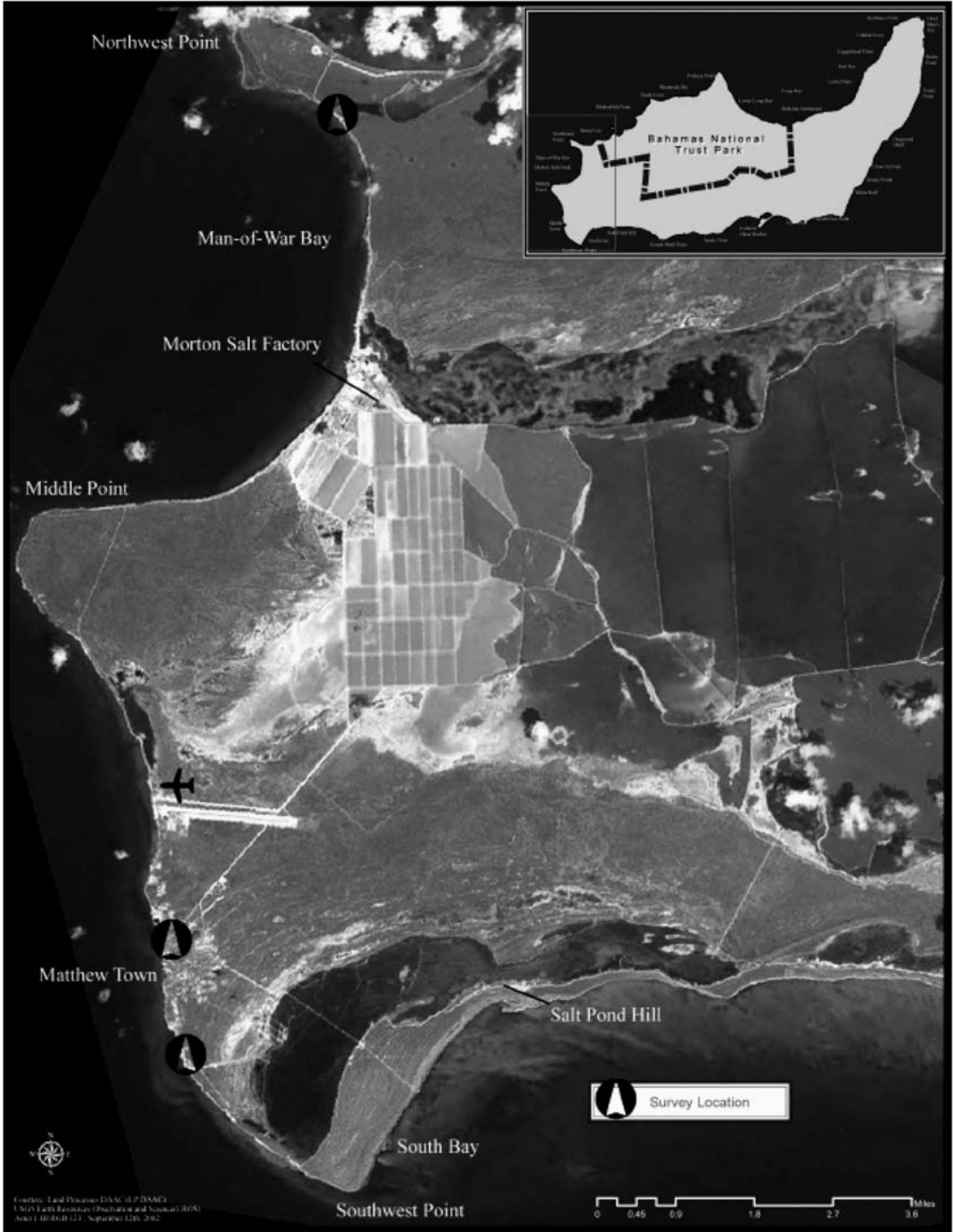
Fig. 2. Satellite photograph of the west end of Great Inagua showing survey sites for O. hyalinipennis .

easily accessible sites with dense populations of cotton were chosen for study. The majority of Great Inagua is made up of large saltwater ponds