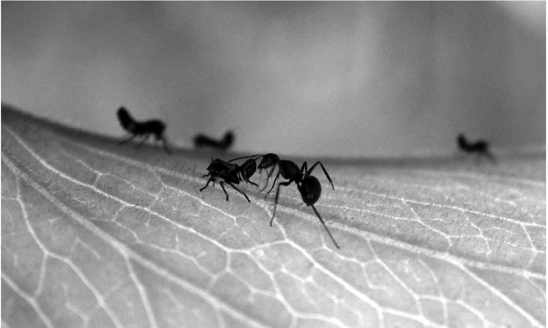
Fig. 2. A Camponotus crassus worker foraging honeydew from Rotundicerus sp. nymph (Cicadellidae, Idiocerinae) in a cerrado area of the Federal District, Brazil.

It is possible, as described for R. minutus (Dietrich & McKamey 1990), that eggs may be inserted almost completely into the stem or the leaf vein of the host plant, but we did not observe this.