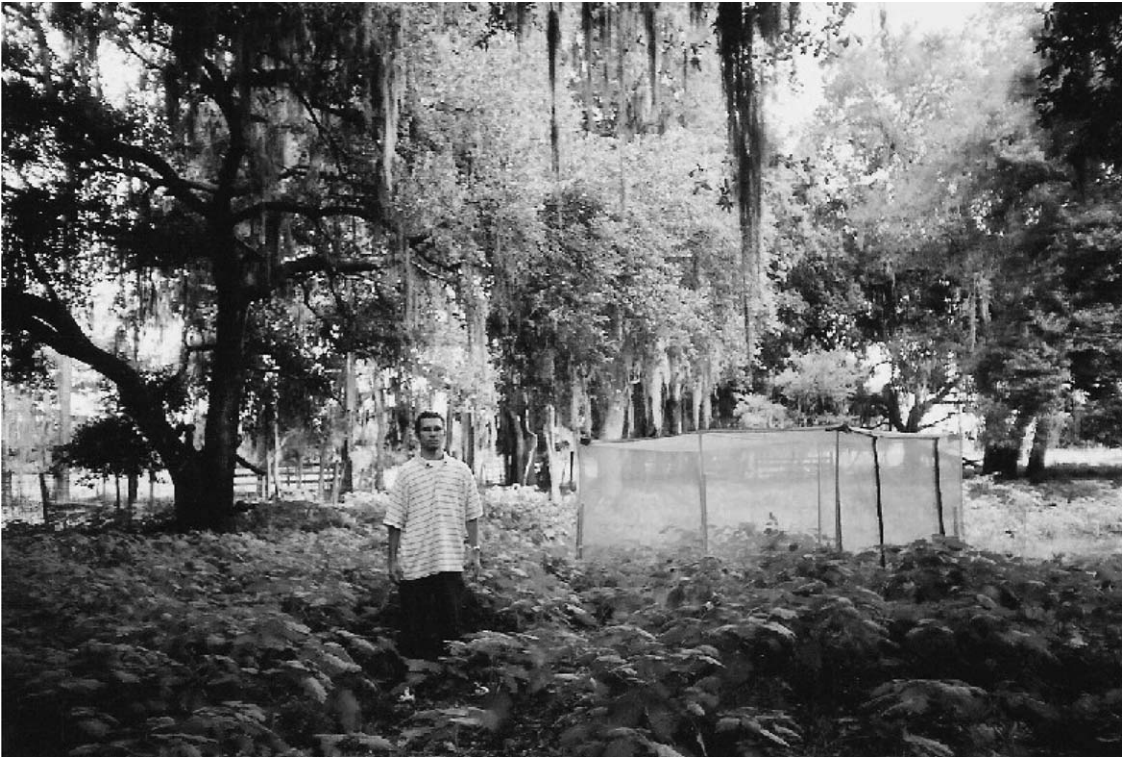
Fig. 3. Tropical soda apple stand before Gratiana boliviana beetles were released. Tropical soda apple covered 100% of the surface. Polk County, Florida, USA, May 2003.

abundance of potential predators at the release sites such as the green lynx spider, Peucetia viridans (Hentz), observed preying on adult beetles, and the red imported fire ants, Solenopsis invicta Buren, observed preying on small and large larvae, this biocontrol agent was capable not only of surviving but of rapid population increase and dispersal to target plants elsewhere. The most likely explanation for the relatively low numbers (average <5 per plant) of beetles recorded on the 20 marked tropical soda apple plants during 2005 was due to the beetles' dispersal from the initial release site to tropical soda apple plants as far as 1,600 m away observed in Sep 2005. Dispersal of the beetles can be attributed to the lack of tropical soda apple foliage caused by the beetle feeding on the target plant since they were released in the previous growing season. Dispersal ability of G. boliviana adults is similar to that of other chrysomelids monitored in weed biocontrol programs (Grevstad & Herzig 1997; DeLoach et al. 2007), or even greater (1.6-16.0 km/year) as indicated by dispersal assessment conducted throughout Florida since 2003 (Medal et al. 2008; Overholt et al. 2009, 2010).