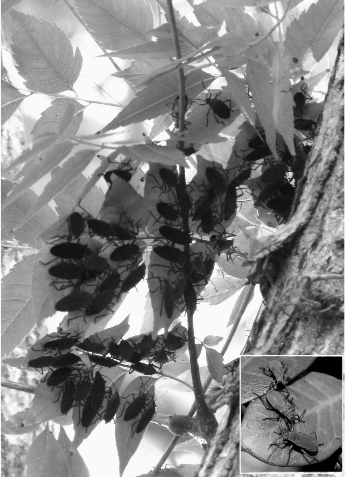
Fig. 1. Group of adult Jadera haematoloma in the canopy of a host Goldenrain tree ( Koelreuteria sp.), Alachua County, FL, Jul 2009. Inset: Adult and nymphs of J. haematoloma from Mar 2009.