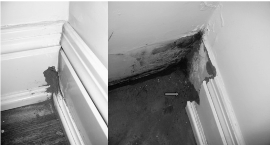
Fig. 1. Skirting board showing fresh wood dust with adult beetles.

There is no previous evidence of Hexarthrum exiguum occurring in Turkey (e.g., Schimitschek 1944); and we now add this species to the entomofauna of Turkey.