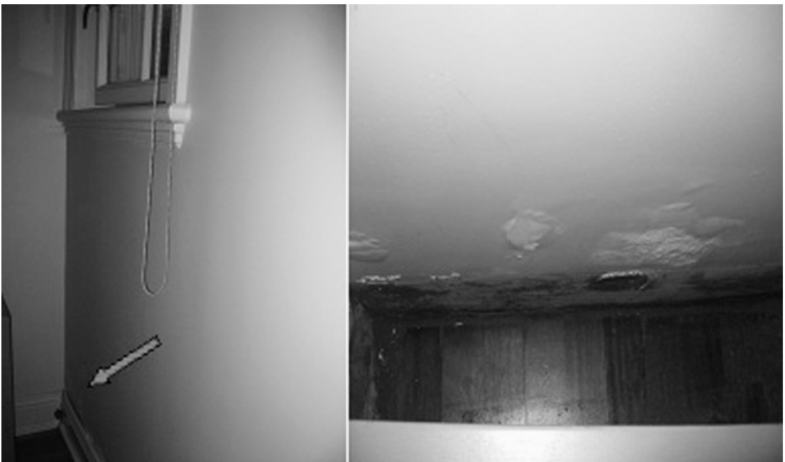
Fig. 3. Effect of high air humidity in basement.

All adult specimens were identified as a Cossoninae, Hexarthrum exiguum (Fig. 2). They are uniformly chestnut-brown in color and cylindrical, and have a typical broad-nosed appearance