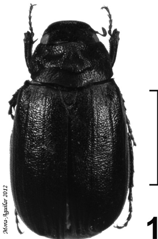
Fig. 1. Habitus of Diplotaxis multicarinata sp. nov. Delgado and Mora-Aguilar. Scale = 5 mm.

surface glabrous and venter with scarce, small setae. Clypeus rectangular, wide, apex truncate, anterior angles rounded, length 2/5 cephalic length; surface broadly concave with large, dense and umbilicate punctures; apical fourth with small, simple punctures; sides slightly indented in front of eyes; ocular canthus not prominent. Frontoclypeal suture marked at sides, obliterated at central 2/3 . Frons with triangular, central, deep impression, and 2 oblique impressions adjacent to eyes and extending to the vertex; surface with large, dense, and umbilicate punctures. Transverse eye diameter almost 1/7 as wide as head. Antennae 10-segmented, length of club equal to length of antennomeres 2-6 combined. Labrum flat, anterior margin slightly curved; at middle 2.1 times longer than and situated slightly below reflexed underside of clypeus; finely rugose. Mandibles large, bulbous. Mentum almost flat, with anterior declivity marked by a transverse, bisinuate, and setose ridge, and with a small, central tooth.