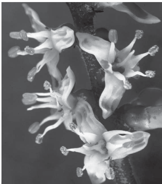
Fig. 1. Flowers of Serenoa repens .

Insect flower visitors were collected from saw palmetto as part of a long-term survey of all flower visitors on flowers of all species in all habitats at the ABS. This project was begun in 1984 and has continued, sometimes at a low level, up to the present. This has been a simple diversity survey; no attempt was made to assess the abundance of