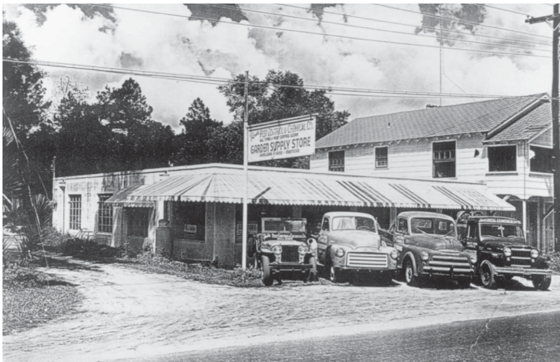
Fig. 2. Florida Pest Control & Chemical Co. Office in 1949.

A method was needed to treat the interior expansion joint from outside of the structure. Dempsey had a student named Butch Sinclair helping him part time. While treating a floating slab foundation for subterranean termites, Sinclair proposed drilling from the outside wall and using a \frac{1}{4} -inch pipe under the slab to treat the underlying fill dirt and expansion joint. They tried it, and to the best of Dempsey's knowledge, that was the first subterranean termite treatment performed in this manner. Dempsey then started using longer rods, some up to 60 feet long. This method was not only less intrusive; it also reduced the odor of the termiticide and exposure of residents in the structure.