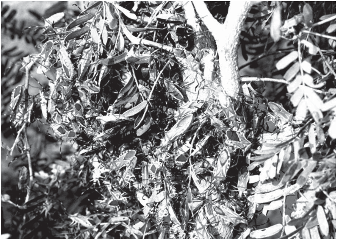
Fig. 1. Aggregation of Homoeocerus variabilis on the leguminous tree, khejri ( Prosopis cineraria ), during the winter season at the Central Institute for Arid Horticulture, ICAR, Bikaner, India.

with un-infested plants) were recorded from Aug 2010 to Jul 2011. The sampling was done by visual observation and manual counting. Average incidence was calculated as the percent of whole trees infested with H. variabilis . Average num-