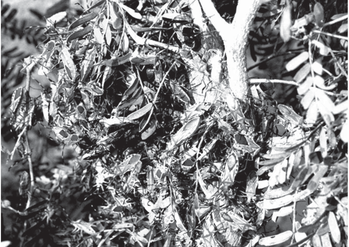
Fig. 1. Aggregation of Homoeocerus variabilis on the leguminous tree, khejri ( Prosopis cineraria ), during the winter season at the Central Institute for Arid Horticulture, ICAR, Bikaner, India.

with un-infested plants) were recorded from Aug 2010 to Jul 2011. The sampling was done by visual observation and manual counting. Average incidence was calculated as the percent of whole trees infested with H. variabilis . Average num-