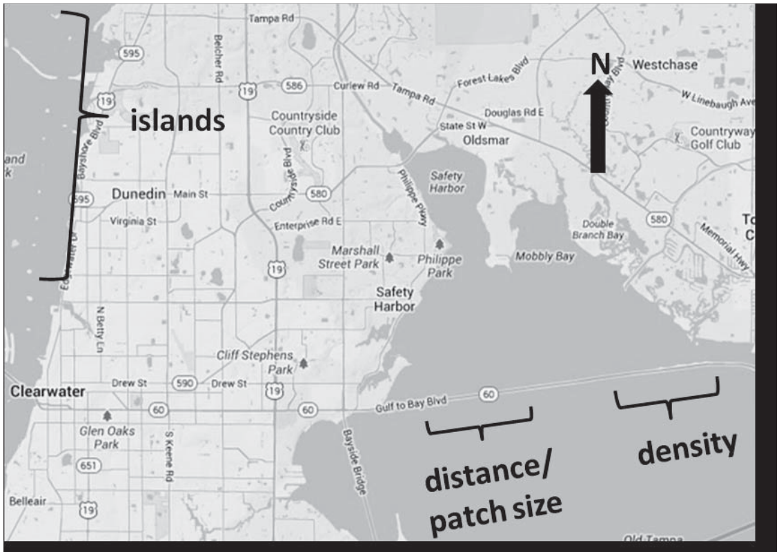
Fig. 1. Map showing overview and relative location of each of the 3 studies. Tampa (Hillsborough County), Florida is to the east.

east side of the CCC bridge is an extensive area of B. frutescens forming a continuous ground cover matrix with I. frutescens shrubs emerging intermittently, such that the distance between the host species is zero; moreover, relative host plant abundances vary with varying Borrchia stem density (Fig. 2). Monthly gall counts were performed from Jan 2009 to Sep 2009 to determine gall densities on I. frutescens and B. frutescens . Additionally, areal density of potential oviposition sites (leaf buds) on Borrchia on both sides of each I. frutescens shrub in the study was measured and the local average determined. Emergence holes were counted concurrently on both species and classified according to whether they were the result of emerging gall midges or parasitoids (Stiling & Rossi 1997). Linear regression analysis was performed using I. frutescens gall density and parasitism rate as response variables and B. frutescens gall density, oviposition site areal density and parasitism rate as independent variables influencing Iva gall density. We predicted Iva gall density to be lower and parasitism rate higher as Borrchia gall density, oviposition site density and parasitism rate increased.