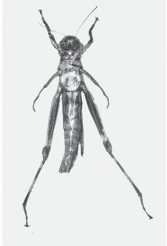
Image 2. Clonacris kirbyi Finot Ventral view