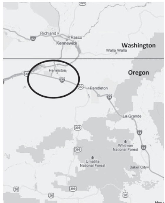
Fig. 1. Map of eastern Oregon. The lower Columbia basin is one of the richest irrigated agriculture areas in the world. Circle shows the area where field plots were located (N 45.8411° W 119.2917°; N 45.8356° W 119.6992°).

In 2007 and 2008, ground beetles were surveyed in first yr commercial organic ( n = 3 ) and conventional potato fields ( n = 4 ) in the Boardman and Hermiston area located east of the Cascade Mountains in Oregon (Fig. 1). Insects were collected with pitfall traps; pitfall traps are widely used to collect soil arthropods in both agricultural and natural systems (Southwood 1978; Adis 1979; Weeks et al. 1997; Hansen & New 2005; O'Rourke et al. 2008). Ten pitfall traps per field were placed in a linear transect; traps were 15.2 m apart. Traps were placed in the rows to prevent flooding from irrigation. Typically potatoes are hilled, creating deep furrows between rows, and thus