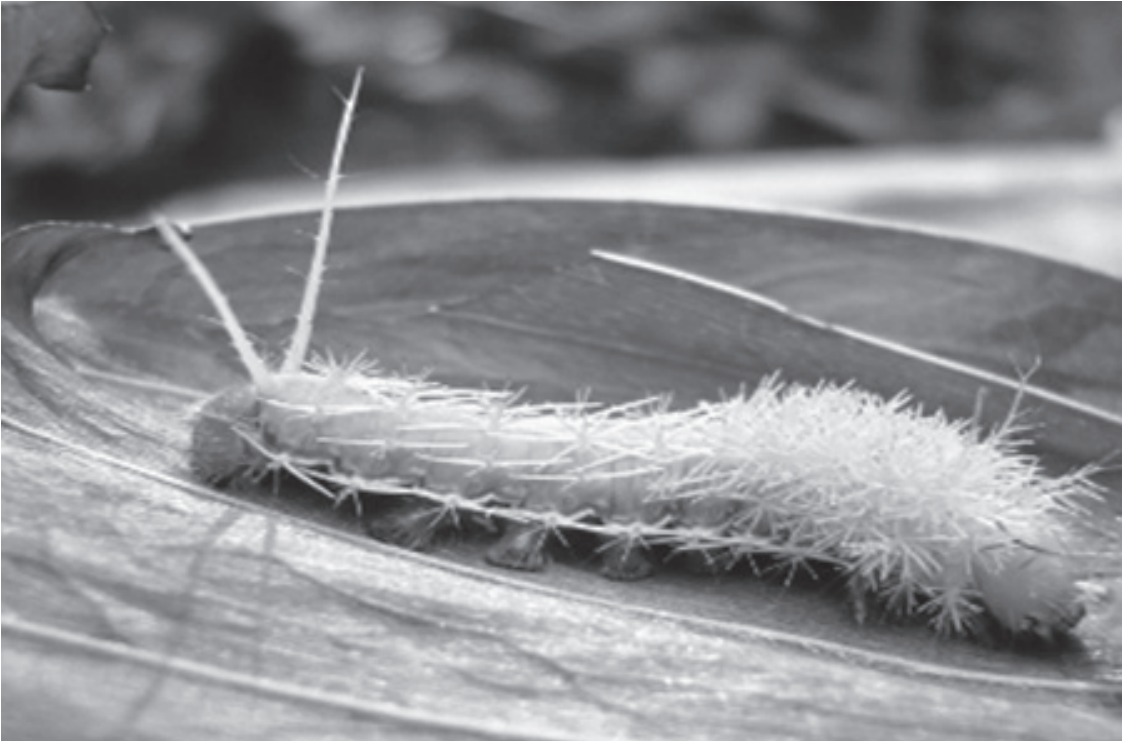
Fig. 2. Caterpillar of Periphoba hircia (Lepidoptera: Saturniidae).

an area of 500 ha in the Peruvian Amazon where it was considered a pest (Couturier & Kahn 1993). It was a secondary pest of Eucalyptus urophylla S. T. Blake (Myrtales: Myrtaceae) in San Carlos, Colombia with outbreaks in isolated areas during the rainy season (Rosales 2001).