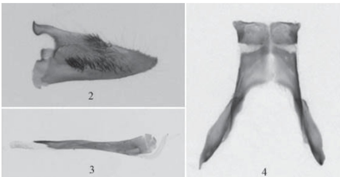
Figs. 2-4. Oligophlebia minor Xu & Arita sp. nov. , (holotype) male genitalia. 2. Valva. 3. Aedeagus. 4. Tegumen-uncus complex.

Male (Fig. 1). Alar expanse 13.0 mm; fore wing 5.5 mm; antenna 3.0 mm; body length 5.0 mm. Head: antenna filiform, black; vertex black; frons with silver sheen scales; occipital fringe dorsally black, laterally white; labial palpus short and white; proboscis long. Thorax: black; patagia black; tegula black; metapleuron posterior with long hair-like black scales. Leg: fore coxa black; fore femur covered with black scales; fore tibia with black hair-like scales; fore tarsus light yellow with fourth and fifth tarsomere black; mid coxa and mid femur covered with black scales; mid tibia covered with black hair-like scales, with a pair of distal spur covered with black hair-like scales; on mid tarsus, first and second tarsomere with black hair-like scales; third and fourth tarsomere light yellow; fifth tarsomere black; hind coxa and hind femur covered with black scales; hind tibia with black hair-like scales, with a pair of mid spurs, with a pair of distal spurs covered with black hair-like scales; hind tarsus mainly light yellow, longer than hind tibia, with first tar-