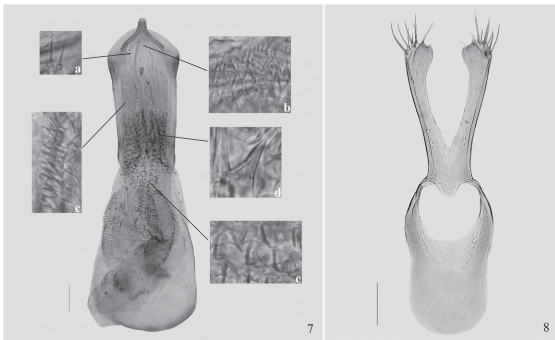
Figs. 7 and 8. Male genitalia of Gibbobruchus bergamini Manfio & Ribeiro-Costa sp. nov. 7. Median lobe; 7a. Setae; 7b-c. Denticles; 7d. Spine; 7e. Subretangular, shallow structures; 8. Lateral lobes. Scale: 7-8. 0.1 mm. Colored versions of these figures can be seen online in Florida Entomologist 97(3) (September 2014) at http://purl.fcla.edu/fcla/entomologist/browse .

of male brown to dark brown (Fig. 6). Ventral region dark brown to black, rarely rufous (Fig. 3). Anterior and middle femur and tibiae bicolor; dorsal half of hind femur sometimes lighter than the ventral half (Fig. 3).