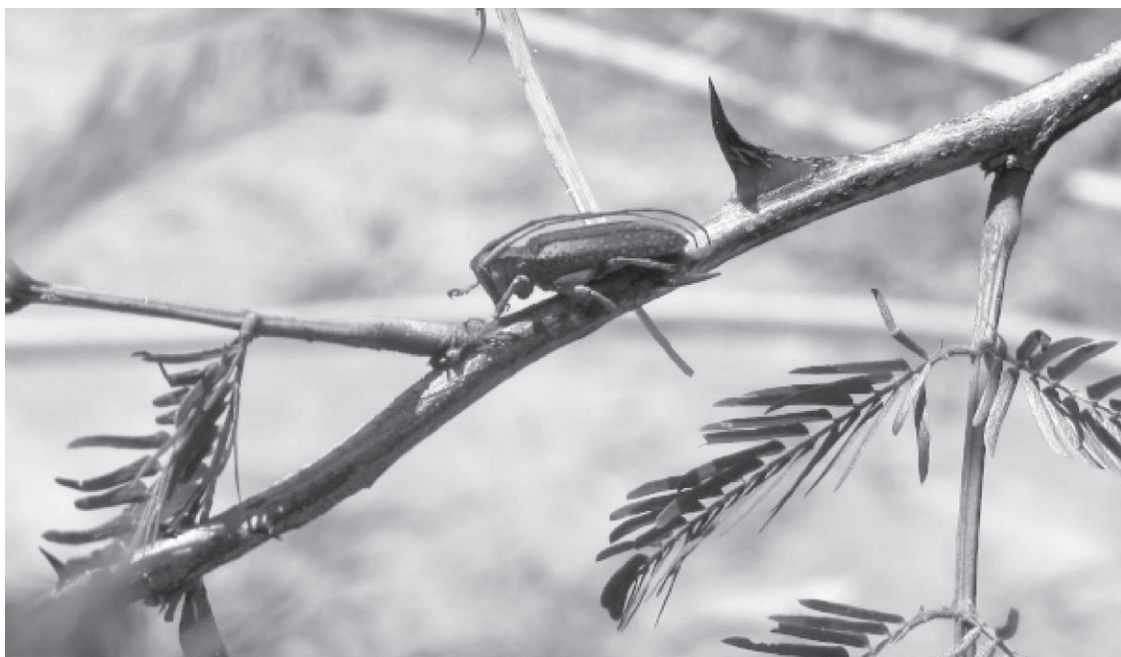
Fig. 1. Oncideres ocularis Thomson, 1868 on a branch of Mimosa bimucronata (DC.) Kuntze.

Weekly visits were made from Dec 2010 to Apr 2011 and Dec 2011 to Apr 2012 to collect fallen branches girdled by this beetle. The diam of the portion where the branches were girdled was measured with a digital caliper with an accuracy of 0.01 mm and its length measured with tape with an accuracy of 0.1 mm. The number of egg-laying incisions was counted per branch. The length of the branch was divided into 5 equal sections (basal, mid-basal, middle, mid-apical and