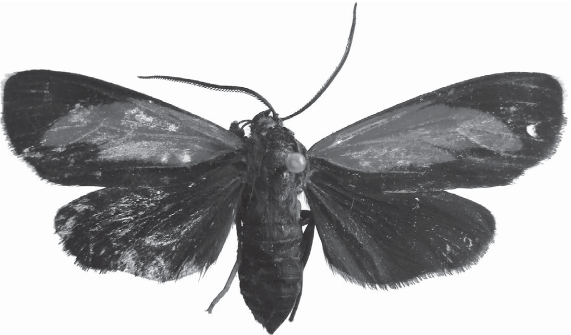
Fig. 1. Specimen of Cyanopepla griseldis (Druce, 1884) deposited at Semarnat/Cites/CP-0026-Ver/05 Scientific Collection, Mexico.