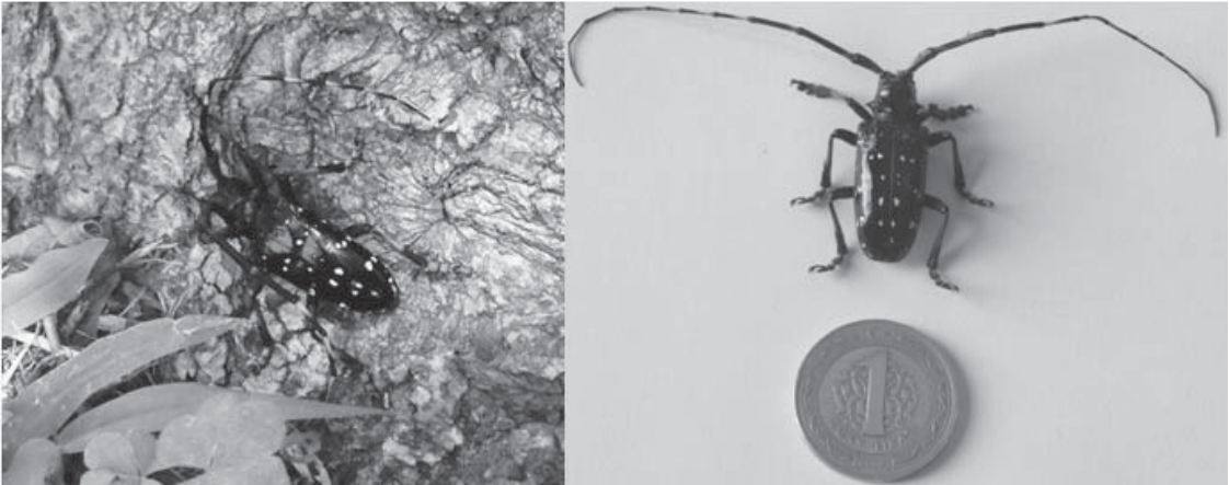
Fig. 2. Adult Asian longhorned beetle, Anoplophora glabripennis .