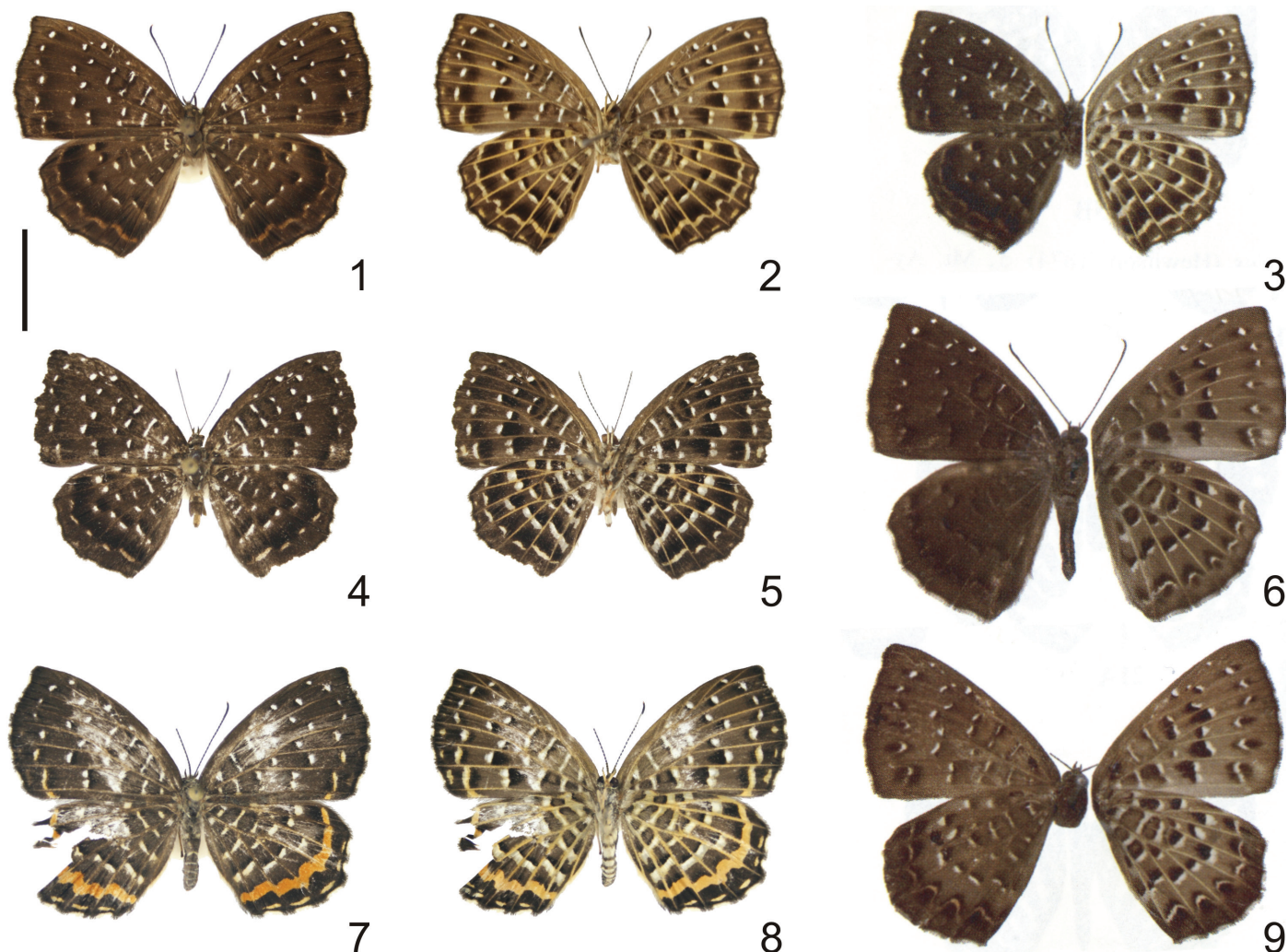
Figs. 1–9. Adults of species of Napaea Hübner, [1819]. 1–5. Napaea joinvilea Hall & Harvey, 2005. 1–2. Male from São Francisco do Sul, Santa Catarina, Brazil. 1. Dorsal. 2. Ventral. 3. Holotype from Joinville, Santa Catarina, Brazil, dorsal (right) and ventral (left). 4–5. Male from Itacaré, Bahia, Brazil. 4. Dorsal. 5. Ventral. 6. Napaea melampia (Bates, 1867), male from "Brazil", dorsal (right) and ventral (left). 7–8. N. joinvilea , female from Atami, Pontal do Paraná, Paraná, Brazil. 7. Dorsal. 8. Ventral. 9. N. melampia , female from "Bahia", Brazil. Figures 3, 6 and 9 reproduced from Hall (2005). Scale bar = 1 cm.

to the small series of specimens examined to explore the phenotypic variation and the absence of the female of N. joinvilea , he stated that is important to find additional specimens from these taxa from another sites to definitively resolve the taxonomic status of N. joinvilea . In fact, he was unsure about the true taxonomic status of N. joinvilea stating that, given the clear-cut differences observed between nearly all Napaeina species, the description of N. joinvilea was "the only subjective species-level taxonomic decision" he had to make while revising the Napaeina (Hall 2005).