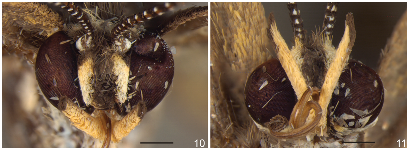
Figs. 10–11. Head of the female of Napaea joinvillea Hall & Harvey, 2005. 10. Anterior view; 11. Ventral view. Scale bar = 0.5 cm.