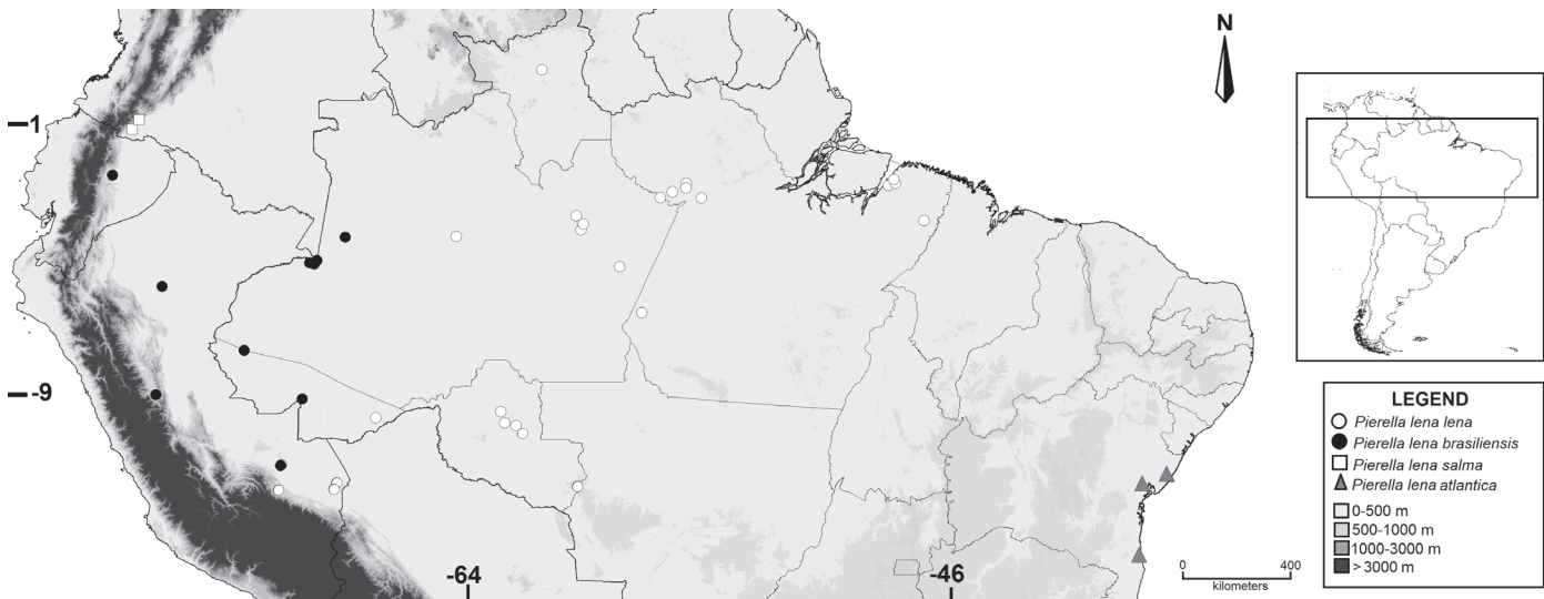
Fig. 3. Geographical distribution of the subspecies of Pierella lena based only on collection specimens