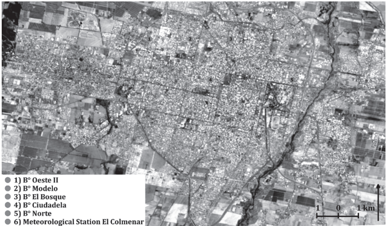
Fig. 1. Aerial photograph of the study area in San Miguel de Tucumán, northwestern Argentina.