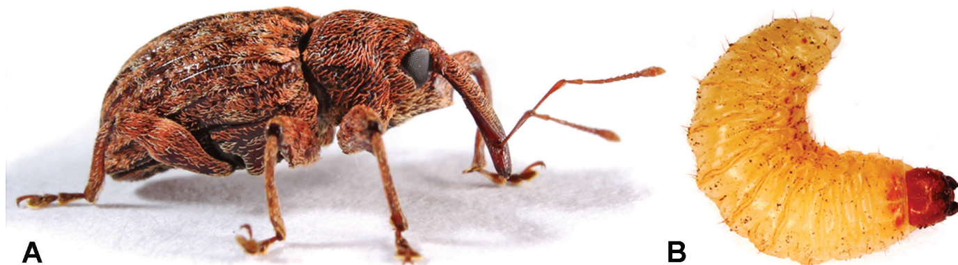
Fig. 2. Avocado seed weevil Conotrachelus perseae (A) adult and (B) larva.

with a semi-sclerotic appearance, was notable. Incomplete peritreme was visible at the anterior and dorsal parts of the spiracles. In most of the collected fruits, 1 or 2 larvae were found, but occasionally up to 16 larvae were counted in a single fruit. The larvae emerged from the fruit and buried themselves in the soil to pupate. After 40 d in the soil, the adults emerged. In the plots where damaged fruits were collected, the level of infestation was approximately 60% of the fruits, and the distribution of affected trees in the plots was aggregated. The above descriptions of both adults and larvae coincide with those previously described by Barber (1919), Muñiz (1970), and Llanderal & Ortega (1990).