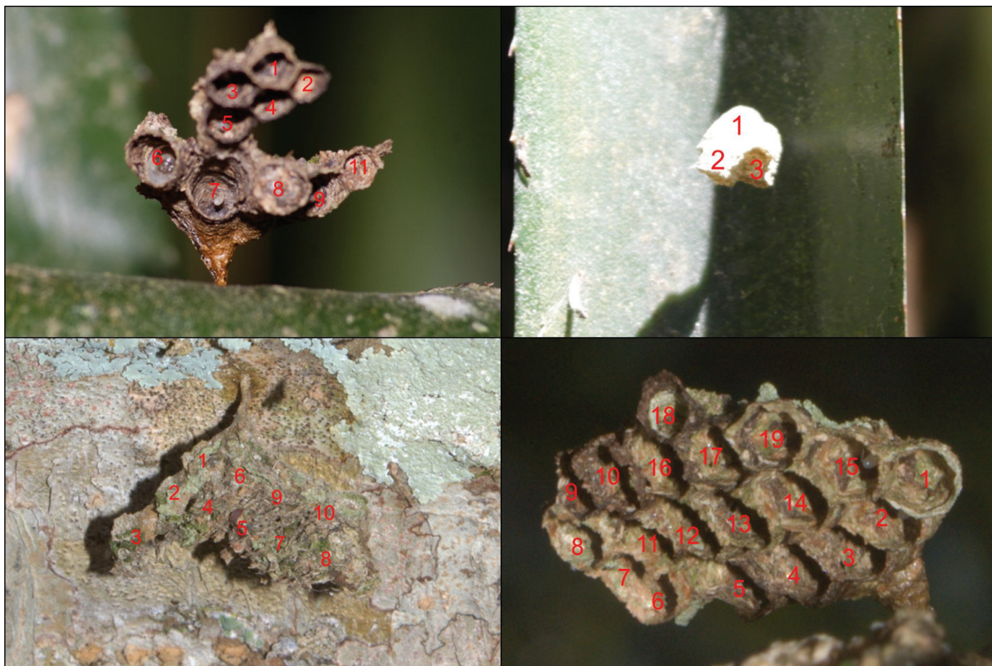
Fig. 1. Construction patterns of Mischocyttarus iheringi nests found in the Botanical Gardens of the Federal University of Juiz de Fora, Brazil, showing the number of cells.

iheringi , which leave the nest during a disturbance and do not exhibit stinging behavior similar to that displayed by most species of social wasps.