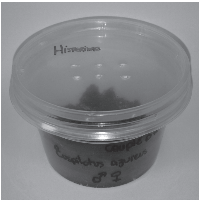
Fig. 1. Experimental arena (250 ml pot) containing 200 g of sifted commercial topsoil, where Euspilotus azureus were paired under controlled conditions (15, 20, 25, and 30 °C; photoperiod 12:12 h L:D; RH 65 \pm 10%).