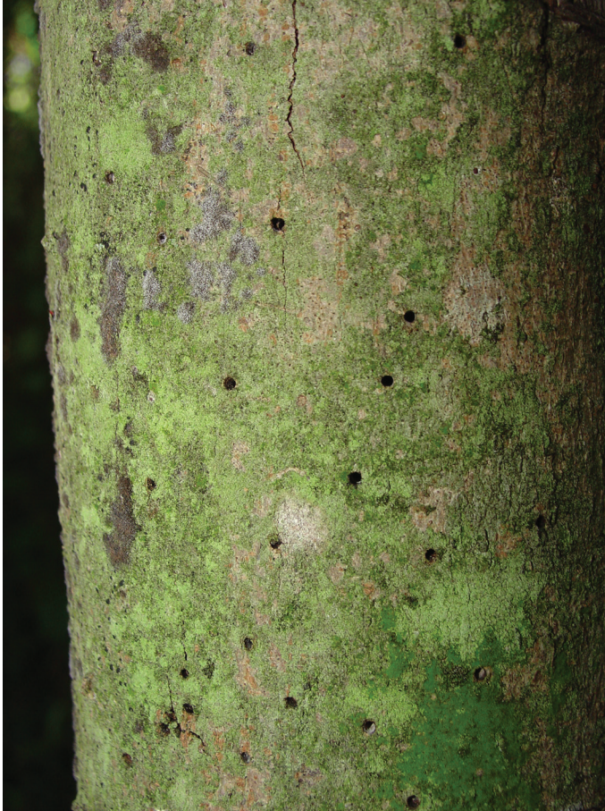
Fig. 1. Ambrosia beetle gallery entrances in the trunk of a Lysiloma latisiliquum . Euwallacea nr. fornicatus and Theoborus ricini were the two most abundant species of ambrosia beetle recovered from L. latisiliquum .

is not known how different Fusarium species affect host selection and colonization by E. nr. fornicatus .