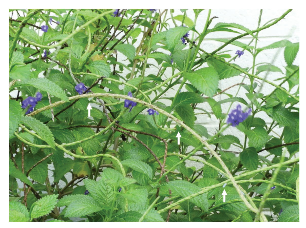
Fig. 4. Egg masses of Petrusa epilepsis on Stachytarpheta jamaicensis (blue porterweed) (A) and Hamelia patens (firebush) (B, C).