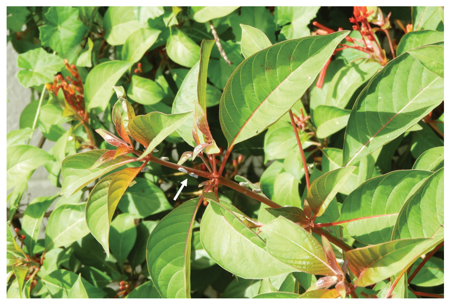
Fig. 2. Petrusa epilepsis feeding on stem of Hamelia patens (firebush).

Sources for distribution and early host records were obtained from Metcalf (1957). Records from South and Central America are poorly supported. The only record from Brazil is from Stål (1869), with no details given. The record from Brazil in Melichar (1902, 1923) references Stål. Similarly, "Insulae Americanae Meridionalis," South American islands, in Stål (1869) could refer to Caribbean islands, as does Melich-