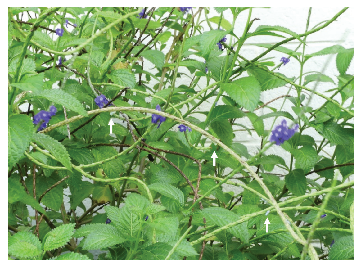
Fig. 3. Petrusa epilepsis feeding on inflorescence of Stachytarpheta jamaicensis (blue porterweed).

Bahder et al.: Establishment of the sea grape flatid, Petrusa epilepsis, in Florida