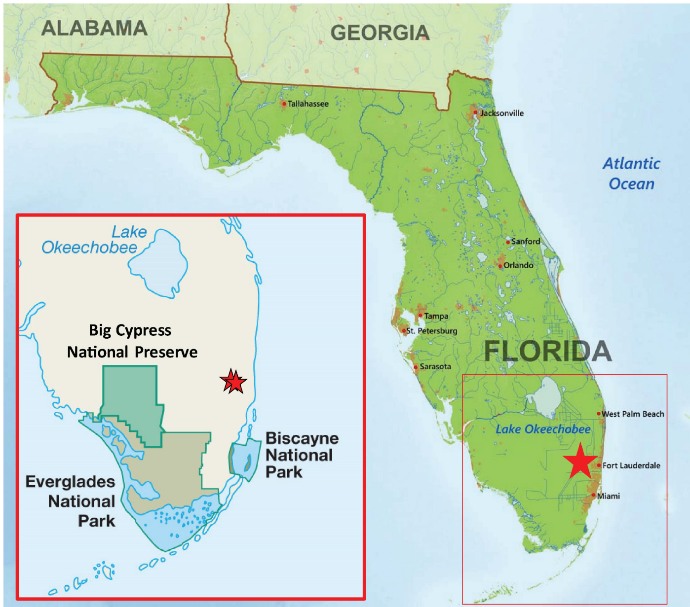
Fig. 2. Liturgusa maya specimens were collected in and near Long Key Natural Area and Nature Center (red star on large map) in Davie, Florida. The inset map indicates the proximity of the 2 collection sites (adjacent red stars) to National Parks and Preserves. (Maps modified from www.freemapsonline.com and www.nps.gov ).