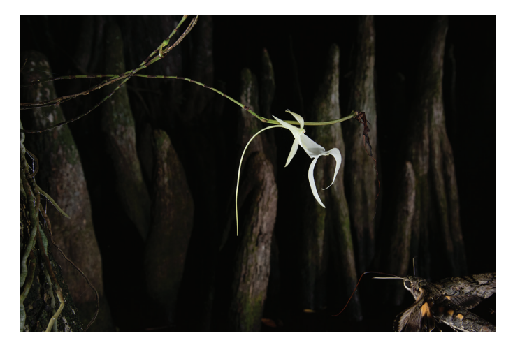
Fig. 7. Cocytius antaeus flying towards Dendrophylax lindenii flower (29 Jul 2018, 8:37 PM Eastern Standard Time).