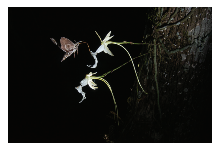
Fig. 4. Dolba hyloeus photographed with Dendrophylax lindenii pollinia at base of proboscis (23 Aug 2018, 8:19 PM Eastern Standard Time).

turnum Jacquin (Orchidaceae). However, we are confident that these pollinia originated from D. lindenii because no other native epiphytic orchid species in the region could accommodate the proboscis lengths of the documented hawk moths, including E. nocturnum. Moreover, the pollinia of Epidendrum orchids typically are more elongated, and have a pronounced stalk leading down to the viscidia (Sheehan & Sheehan 1979). We also did not observe any other orchids in flower in the immediate area at the time of the study. Whether or not the flowers depicted in Figures 1, 3, and 4 were actually fertilized is not known, but several ghost orchids at the site did develop seed capsules both during and after the study. Of particular note is the ghost orchid seed capsule that can be observed in Figures 3, 5, 6, 7, and 11 to 13. This individual ghost orchid is about 22 m away from the ghost orchid depicted in Figures 1, 2, 4, 8, 14, and 15. Additionally, another known ghost orchid that is located approximately 3 m away from the ghost orchid depicted in Figures 3, 6, 7, and 11 to 13 also formed a seed capsule after the study concluded. As such, pollination did take place within the study area, and occurred in close proximity to the ghost orchids where moths carrying pollinia were photographed.