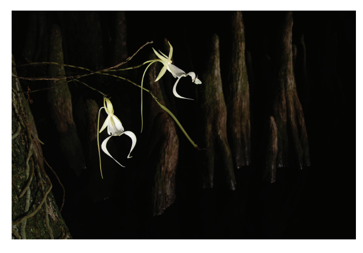
Fig. 13. Unidentified Geometrid moth visiting Dendrophylax lindenii flower (15 Aug 2018, 9:25 PM Eastern Standard Time).