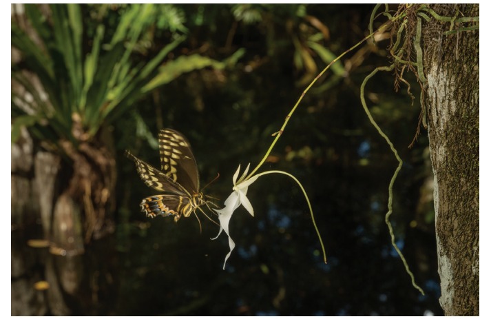
Fig. 10. Palamedes swallowtail butterfly ( Papilio palamedes ) visiting Dendrophylax lindenii flower during daylight hours (9 Aug 2017, 10:59 AM Eastern Standard Time).