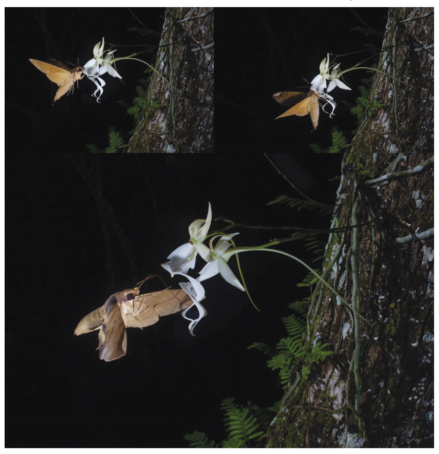
Fig. 1. Pachylia ficus, shown nectaring on Dendrophylax lindenii in top 2 images (3 Jul 2018, 8:55 PM Eastern Standard Time), and carrying pollinia in lower image (5 Jul 2018, 5:43 AM Eastern Standard Time). Pollinia are yellow in color, and can be observed on the moth's forehead, at base of proboscis.

pollinia affixed to the head region at the base of the proboscis (Figs. 1 & 4, respectively). The location of the pollinia on these moths coincides with the orchid's floral column, thereby signifying that these 2 moth species are likely pollinators of D. lindenii . In a second image (Fig. 3), pollinia appear also to be affixed to the proboscis itself in P. ficus . Camera traps captured a single image of a hawk moth flying towards a D. lindenii flower with its proboscis nearly touching a D. lindenii flower on 7 Aug 2018 at 12:15 AM Eastern Standard Time (Fig. 8). Because the photograph lacks sufficient evidence to conclusively identify this moth as A. cingulata , there are some visible characteristics which would indi-