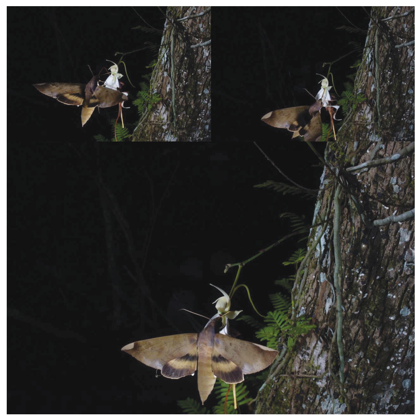
Fig. 2. Stages of proboscis insertion by a female Pachylia ficus (8 Jul 2018, 8:40 PM Eastern Standard Time). Note the close proximity of the insect's head to the column following complete insertion of the proboscis into the nectar spur (lower image).

dates and times of all Lepidoptera that were photographed visiting D. lindenii flowers during the study, with references to figures, if any. Although physical capture of these moths would have been preferable to photographic evidence alone, the high quality images rendered by the digital single lens reflex camera traps allowed for positive identification of most of the larger lepidopterans to the species level. For field-based pollination studies, the camera-trapping technique described herein should provide researchers with a useful tool for studying insect pollination, especially in remote areas. For orchids, which are notorious for having long-lasting flowers and few pollinator visits, this technique also may be especially useful.