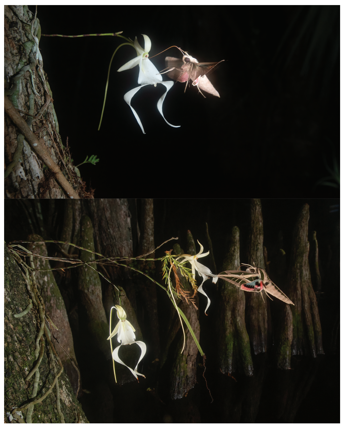
Fig. 5. Top image: Eumorpha fasciatus in the act of inserting its proboscis into the nectar spur, opening just beneath the column of the flower (4 Jul 2018, 2:49 AM Eastern Standard Time). Bottom image: Eumorpha fasciatus flying towards Dendrophylax lindenii flower (2 Sep 2018, 9:33 PM Eastern Standard Time).