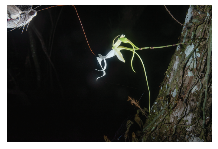
Fig. 8. Suspected Agrius cingulata flying towards Dendrophylax lindenii flower (7 Aug 2018, 12:15 AM Eastern Standard Time).