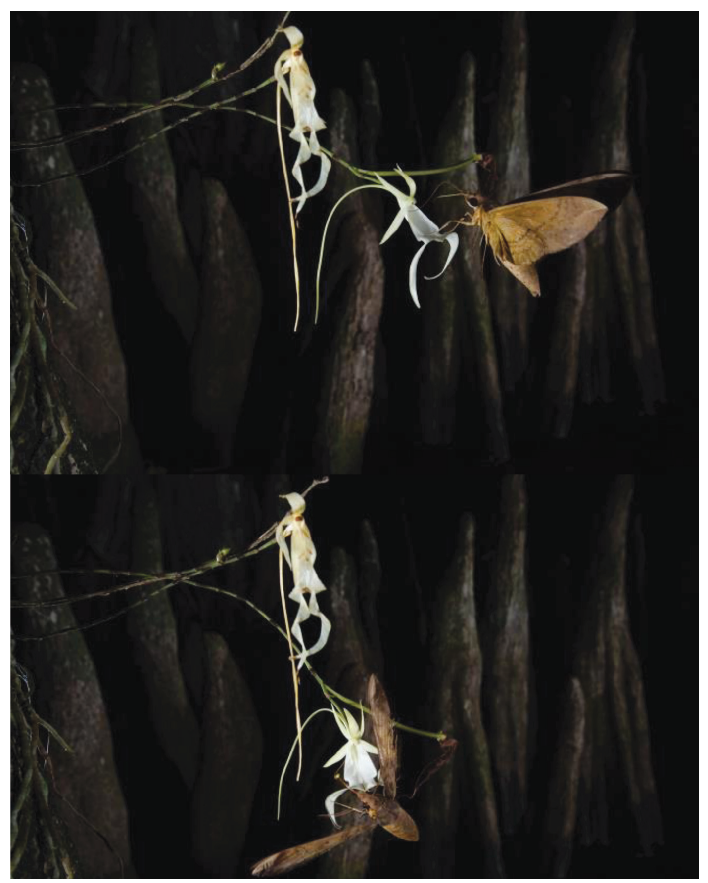
Fig. 3. Pachylia ficus shown inserting its proboscis into the nectar spur opening (top). In the bottom image, pollinia are shown affixed to the proboscis itself (26 Jul 2018, 8:29 PM Eastern Standard Time).