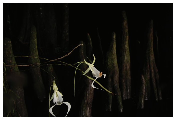
Fig. 12. Unidentified Geometrid moth resting on the lower labellum of a Dendrophylax lindenii flower (15 Aug 2018, 6:19 PM Eastern Standard Time).