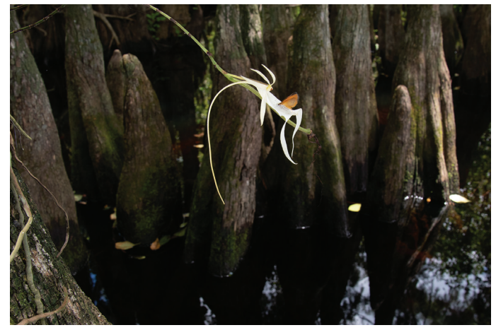
Fig. 11. Unidentified Geometrid moth resting on the labellum of Dendrophylax lindenii flower. The head of the insect is positioned over the concave labellum's upper surface where moisture droplets from dew and rain have been known to accumulate (6 Aug 2018, 2:02 PM Eastern Standard Time).