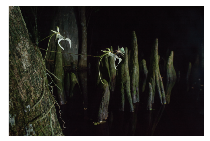
Fig. 9. Seagrape spanworm moth ( Ametris nitocris ) on Dendrophylax lindenii flower (20 Jul 2017, 12:04 AM EST).