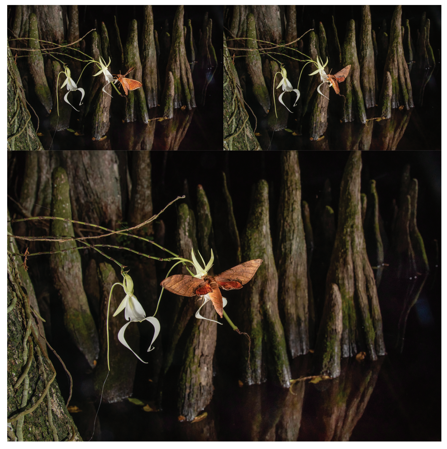
Fig. 6. Photo sequence of Protambulyx strigilis nectaring on Dendrophylax lindenii flower, with proboscis fully inserted into the nectar spur in the bottom image (17 Aug 2018, 10:07 PM Eastern Standard Time).

emphasis on the specialized needs of orchids (e.g., pollinators, mycorrhizal fungi); (2) establishment of ex situ seed and mycorrhiza banks for orchids under immediate threat; and (3) development of orchid restoration techniques. For D. lindenii , all 3 of these actions have been achieved largely due to coordinated research efforts in southern Florida and Cuba during the past decade (see Hoang et al. 2016; Mujica et al. 2018; Zettler et al. 2019; Coopman & Kane 2019). Collectively, all of these efforts have aligned in favor of D. lindenii with 1 important exception – virtually no information existed on the pollination biology of the ghost orchid until now. In addition to the aforementioned actions,