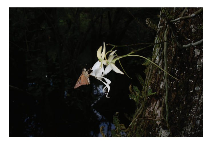
Fig. 15. Brazilian skipper ( Calpodes ethlius ) visiting Dendrophylax lindenii flower (2 Jul 2018, 5:50 PM Eastern Standard Time).