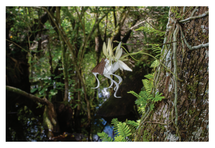
Fig. 14. Monk skipper ( Asbolis capucinus ) visiting Dendrophylax lindenii flower (22 Jun 2018, 10:13 AM Eastern Standard Time).