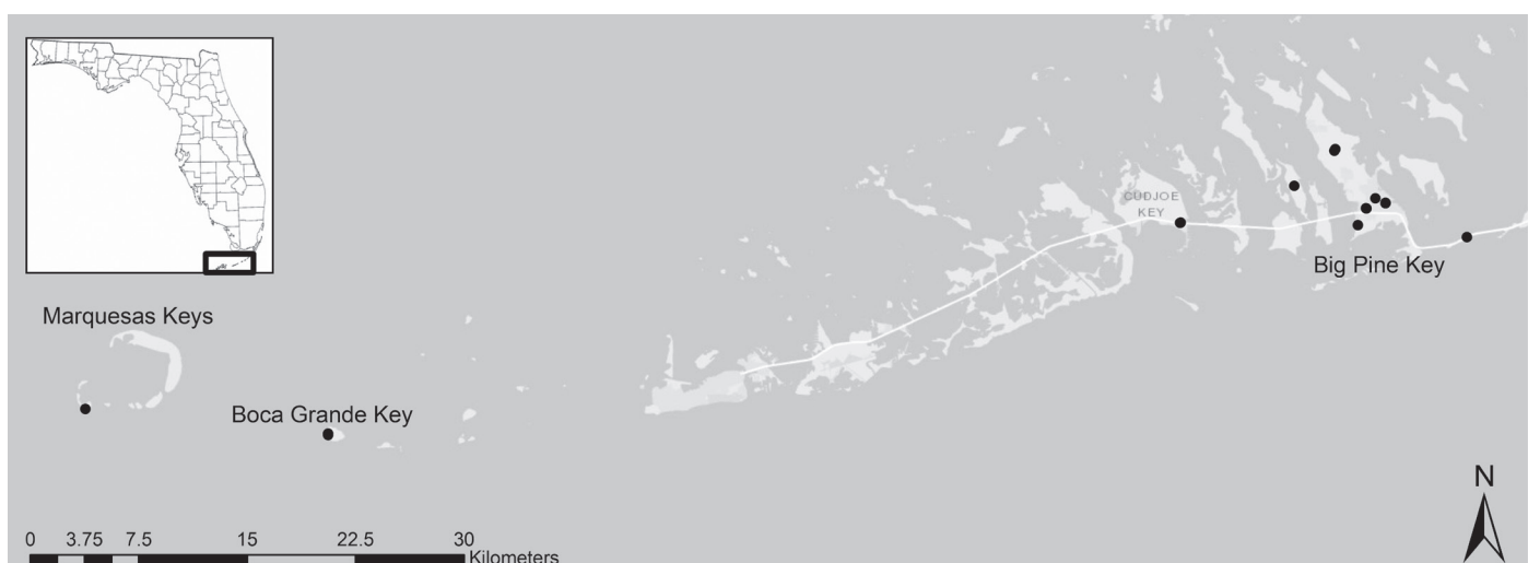
Fig. 16. Map of collection sites.

The first specimen of this undetermined species was a male reared on nickerbean foliage brought to Gainesville. Based on the male, J. Baixeras (Universitat de València personal communication) remarked that it seems to represent an undescribed species. The Division of Plant Industry team subsequently found larvae rolling leaves at a vacant lot on Palmetto Avenue on Big Pine Key. One female emerged from that lot (Fig. 8); the other larvae perished during the return to Gainesville. It should be easy to rear locally. Crociosema Zeller species (Lepidoptera: Tortricidae) feed on various plant families, and Crociosema aporema (Walsingham) (Lepidoptera: Tortricidae) is a major pest of legumes. The male genitalia, although similar to those of C. aporema , more closely resemble Epiniotia arctostaphylana (Kearfott) (Lepidoptera: Tortricidae), a Western species (Heinrich 1923), but the new species has androconia typical of Crociosema . The male has hair pencils on the dorsal base of the forewing that probably fit underneath tufts on the abdominal pleura. We could not find any conspecific specimens in the Florida State Collection of Arthropods or McGuire Center for Lepidoptera and Biodiversity collections, including material recently collected in the Bahamas by J.Y. Miller and D. Matthews. The male and female