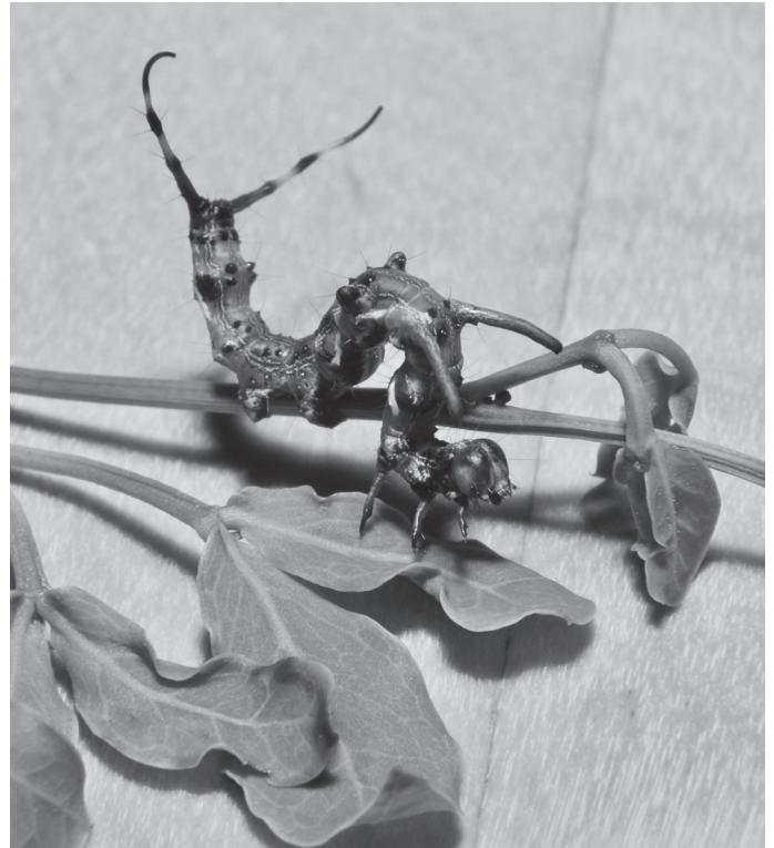
Fig. 18. Tyrissa multilinea larva on Pithecellobium keyense .

do not exactly match any described species that is illustrated in its original description, but the maculation resembles Crociosema cayeya Razowski and Becker (Lepidoptera: Tortricidae) and other Antillean species. Several species of Crociosema have been described in recent yr, some only on the basis of less variable female specimens. We hesitate to provide a formal description until more specimens of it and congeners can be obtained from the Caribbean region. No specimens were caught in the Malaise trap at the site despite biweekly trap servicing.