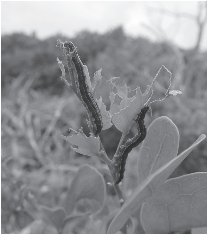
Fig. 17. Melipotis januaris larvae on Pithecellobium keyense .