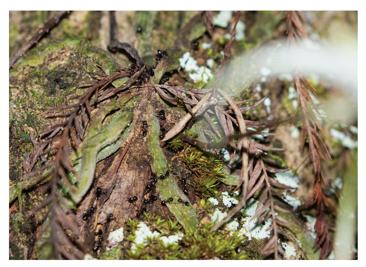
Fig. 2. Crematogaster ashmeadi emerge and return via cavities excavated beneath roots of Dendrophylax lindenii. Individuals make mandible contact with the roots.

Photos, videos, and direct field observations indicated that the ants were patrolling the orchid (Figs. 2, 3). Individuals moved in and out of