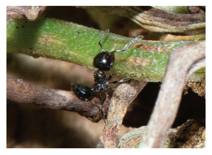
Fig. 3. An individual Crematogaster ashmeadi patrolling the roots of Dendrophylax lindenii .

2020 — Florida Entomologist — Volume 103, No. 3