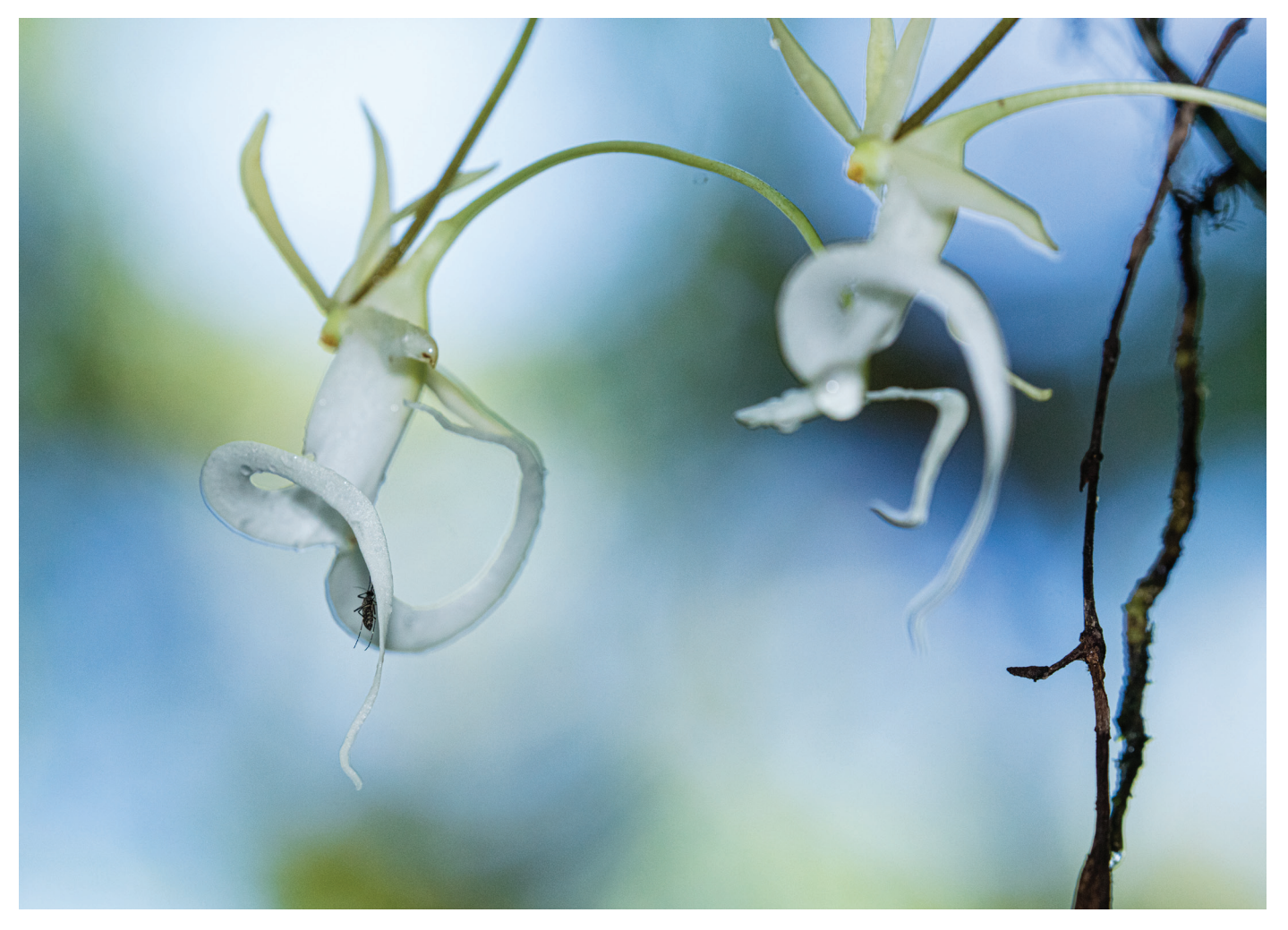
Fig. 5. A mosquito, Aedes taeniorhynchus, rests on a Dendrophylax lindenii flower. This is a common occurrence that may indicate insect attraction to volatile compounds emitted by the orchid, and also potential prey for ambush predators on its flowers.

in situ (Jones et al. 2017). In a floristic study of the Everglades of southern Florida (Koptur 1992), 9% of species (78 of 851 spp.) were reported to contain extra floral nectaries. Although D. lindenii was not one of the 9 orchid species identified with extra floral nectaries, that study did not state if this orchid was assessed. However, we believe that this species was not present because the primary focus of investigations were carried out in Everglades pineland and sawgrass prairie habitats rather than flooded forests characteristic of D. lindenii in the Big Cypress Basin. Indeed, Hoang et al. (2016) dissected numerous D. lindenii for anatomical studies that were germinated from southern Florida seeds and did not identify extrafloral nectaries on the stem, root, or leaf primordia (N. H. Hoang personal communication). The study of extra floral nectaries within flooded forest habitats remains limited (Koptur 1992). Based on observations of mandible prodding of roots by ants in our study (Fig. 3), root masses warrant further inspection for possible secretions. As stated earlier, it is possible also that volatiles, rather than extra floral nectaries, play a role in attracting ants to this orchid (Willmer et al. 2009).