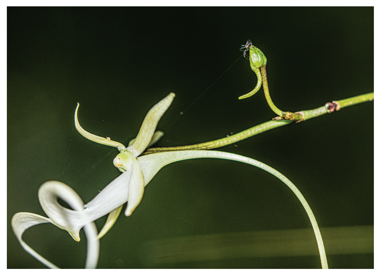
Fig. 4. A spider of the Family Araneidae descends and begins constructing a web on a ghost orchid flower. The flowers are frequented by mosquitoes, which may be the target prey.

In our study, C. ashmeadi was observed only on developing inflorescences of D. lindenii with buds (Figs. 2, 3, 6), suggesting the possibility of extra floral nectaries on those structures and spikes, or a possible role of volatile compounds. Extrafloral nectaries contribute to the greatest number of ant-orchid associations (Fisher 1992) that can occur on nearly all orchid structures, and secrete nectar from glands on developing inflorescences, shoots, buds, and fruits (Marazzi et al. 2013). Furthermore, biotic and abiotic factors influence extra floral nectary production in the wild, which can strongly affect ant-plant interactions