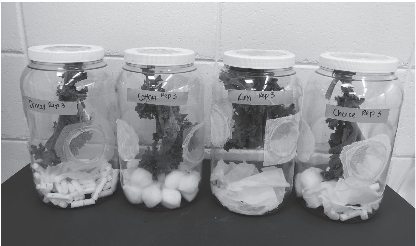
Fig. 1. Large cages for no-choice and choice tests for evaluating the preference of Bagrada hiliaris for 3 artificial oviposition substrates: dental wicks, cotton balls, or Kimwipes.

There is a risk that Bagrada hiliaris will be transported from the southwestern USA and establish in Florida where it could infest Brassi-