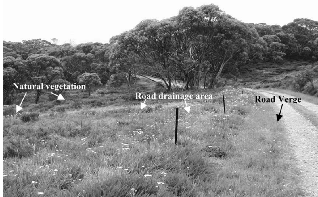
FIGURE 2. Photograph of typical study sites (Schlinks Pass) showing the three ecotypes examined: natural undisturbed area, road drainage area, and road verge.

Plant cover abundance was measured using an adapted Braun-Blanquet method, as a percentage of the proportion of ground covered by the vertical projection of foliage (Mueller-Dombois and Ellenberg, 1974). Plant composition was compared using one way ANOVA (SPSS Version 10.0 for Windows) (Coakes and Steed, 2000), with site as a block. Mean and standard deviation for individual species and species type were calculated and are presented in Tables 2 and 3.