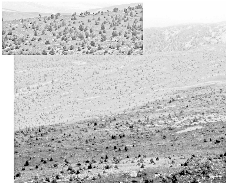
FIGURE 1. General view of the study area including a detailed view of the expanding Pinus uncinata population (inset).

might be affected by their isolation history and genetic differentiation. In addition, the greater sensitivity of stands at the species' range limit may be a result of the fact that climate is expected to be among the main constraints on tree recruitment in these populations. Recruitment is among the most critical determinants of the rate of forest shift to climatic change. Tree recruitment has been shown to be more sensitive to climate than adult mortality in harsh environments, where competition is low, because recruitment has lower climatic thresholds than adult mortality (Lloyd, 1997). However, the temporal dynamics of recruitment have not been carefully investigated in most tree species, and specifically in isolated stands (Veblen, 1992). In addition, tree recruitment in harsh environments might be also modulated by positive feedbacks at small spatial scales (Camarero et al., 2000; Smith et al., 2003; Bekker, 2005).