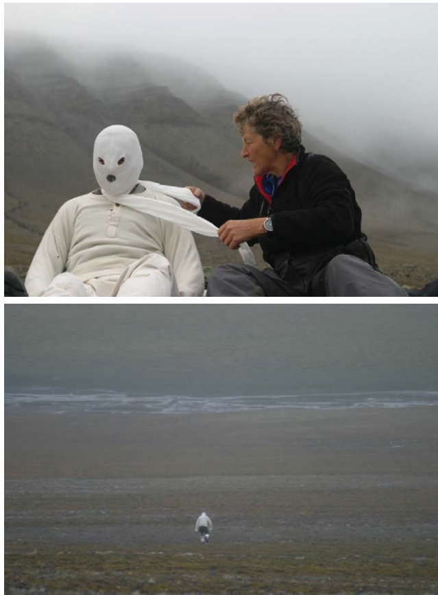
FIGURE 2. Lead author disguised as a polar bear approaching a group of Svalbard reindeer. Limited supplies of white clothing left the back of the observer uncovered.

displacement distance by the reindeer after taking flight. All response distances were measured with laser monoculars (Leica Rangemaster 1200 Scan; 1 m accuracy at 1000–1200 m).