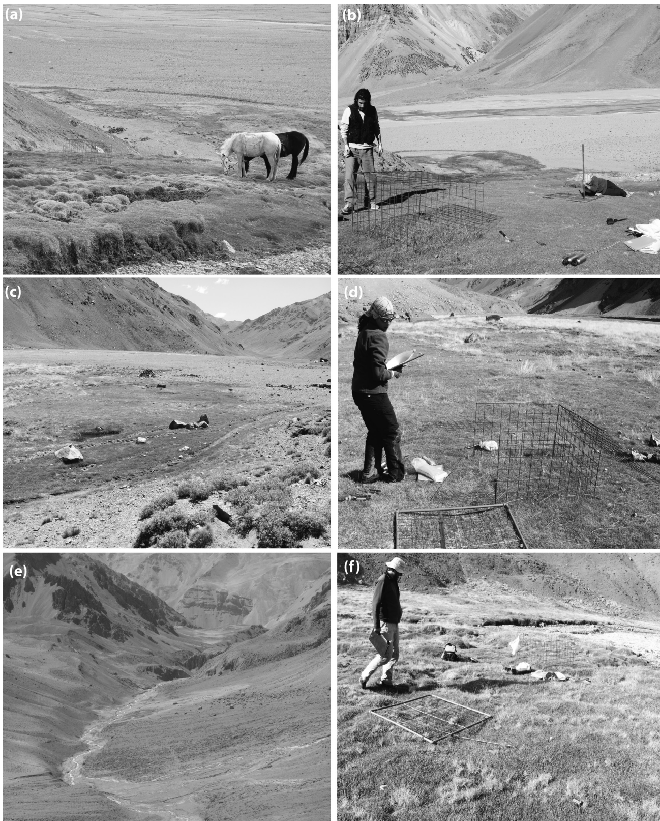
FIGURE 2. General view of the three meadows (left) and of an enclosure in each alpine meadow at the end of the experiment in March 2011 (right) in Aconcagua Provincial Park. (a, b) Meadow 1, (c, d) Meadow 2, and (e, f) Meadow 3.

species. Multiple hits per point were possible where different species occurred at the same point. The number of points that touched litter underneath living vegetation was also recorded. These data were